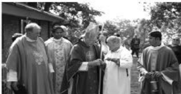
The Bishop enjoyed speaking with the residents during the Rededication.

celebrate the Feast of St. Louis Guanella. Mass will begin at 4:30pm. All are welcome to attend, but please RSVP by October 16th to kellyf@stlouiscenter.org .